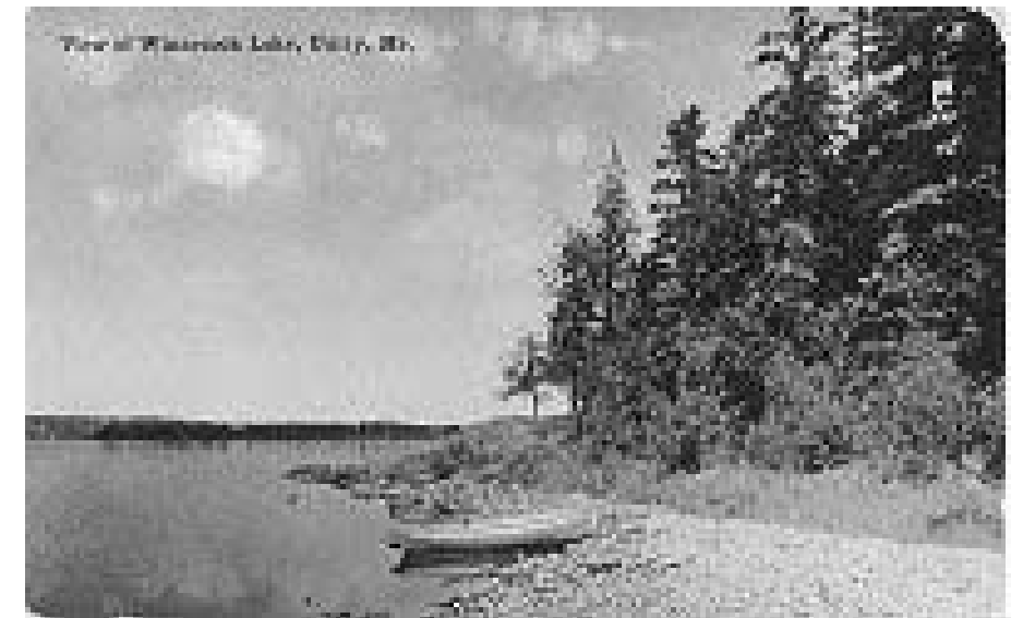
Depot Street.